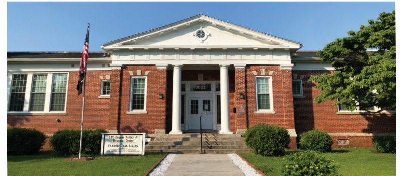
Sgt. Eugene Ashley Center