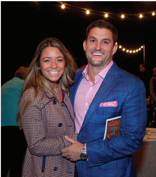
Guests at Flavor of NC 2017; Photo by Emmy Errante

Saturday, November 17, 2018 Carolina Yacht Club at Wrightsville Beach (Indoor and Outdoor Venue!) Please note the new location!