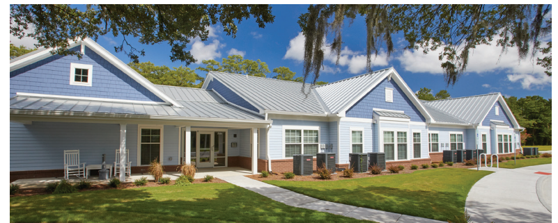
SECU Lakeside Reserve