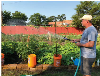
Tending the garden!