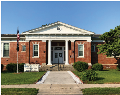
The Ashley Center

In addition to the 16 units of Bridge Housing, the Ashley Center continues to house 8 homeless Veterans and other men with disabilities in the Permanent Supportive Housing wing of the Center.